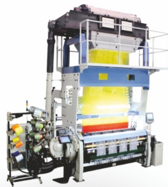
Weaving Knitting Machine