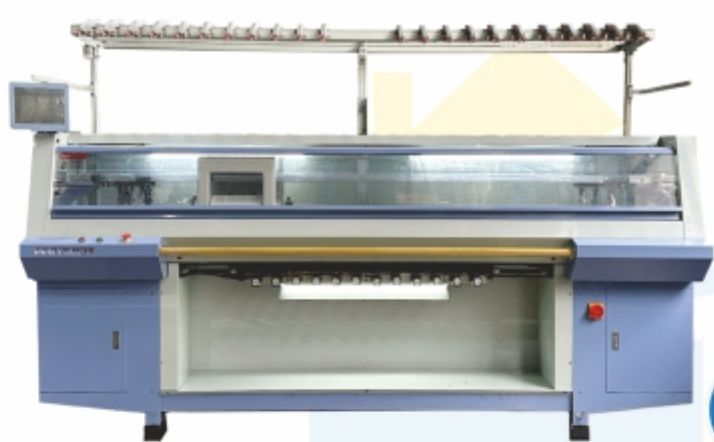
Whole Garment Knitting Machine