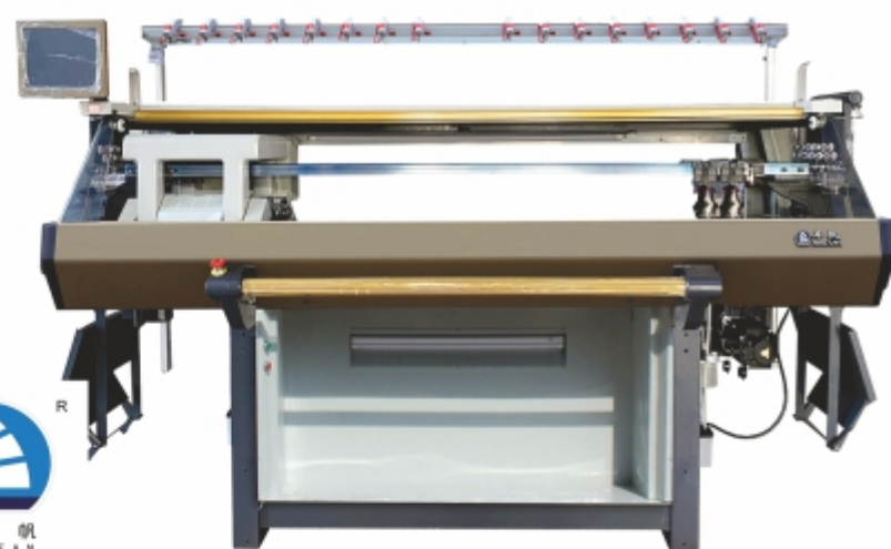
Computerized Flat Knitting Machine (18 Gauge D2)