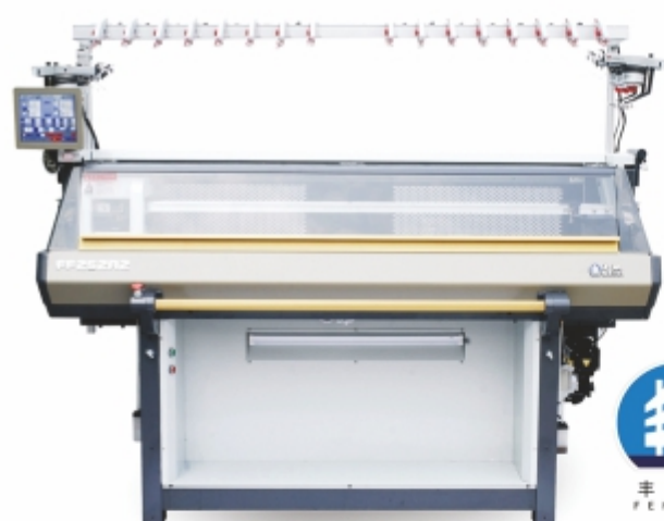
Computerized Flat Knitting Machine (10 Gauge)

Dana Mandi, Bahadur Ke Road, Nr. Jalandhar Bye Pass, Ludhiana, India