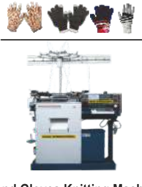
Hand Gloves Knitting Machine (Hisen)