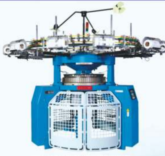
CIRCULAR KNITTING MACHINE

All kinds of Second Hand & Reconditioned Circular Knitting, Collar Knitting, Flat Knitting Machines, Shoe Upper Machines, Textile & Finishing - Pile Cut, Raising, Brushing & Shearing Cut Machines