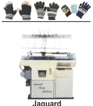
Jaquard Hand Glove Knitting Machine