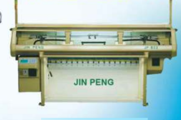
COLLAR FLAT KNITTING MACHINE

Computerized Collar Flat Knitting Machines (Gauge 14", 16", 18", Plain, Mini Jacquard and Full Jacquard)