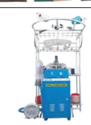
Cap Knitting Machine (Min-Hui)