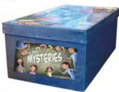
(MAPS Kit Champion I7)