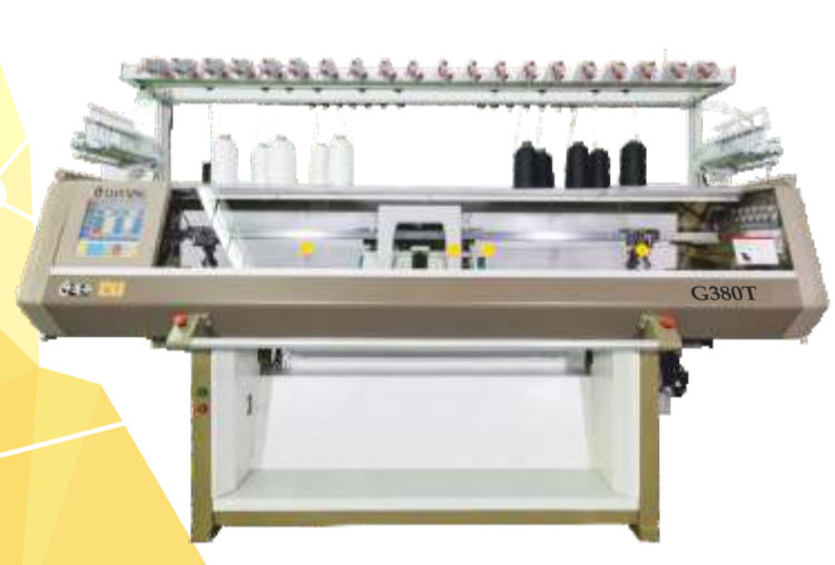
Gold Plus Speedii