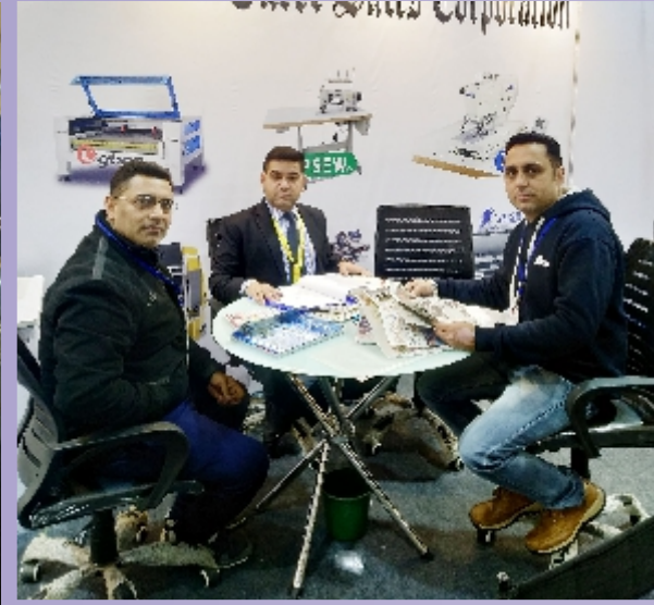
TUREL SALES CORPN