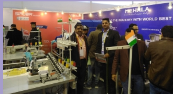
MEHALA SEWING MACHINE