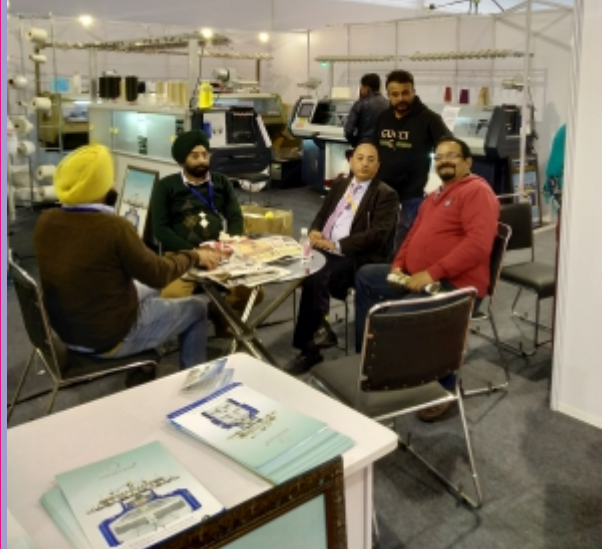
P K INTERNATIONAL