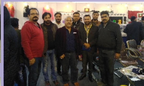
R R ENTERPRISES