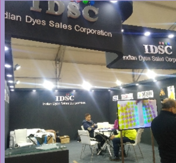
INDIAN DYES SALES CORPN

Presented here are photographs from the stalls of some other exhibitors who presented their products t GMMSA 2019.