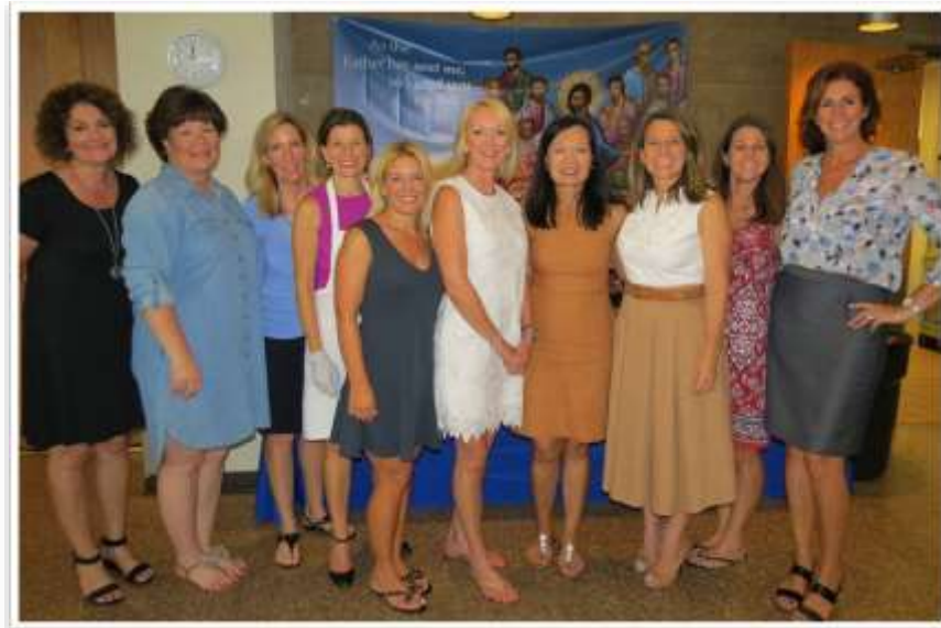
OPA Board members