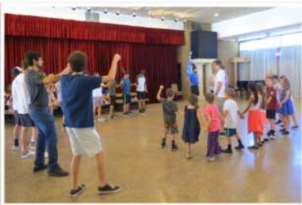
(left top and bottom) High school boys from Pyrkagia dance with the youngest group Petra Asterakia.