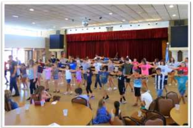
(right top) Multiple groups practicing the Grand Finale.