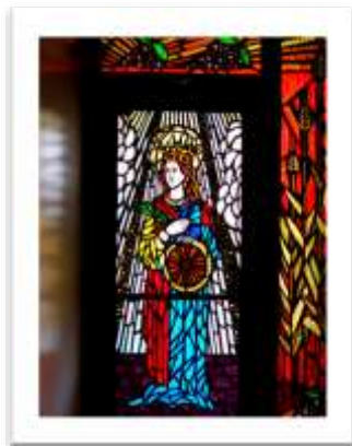
St. Katherine faceted glass icon in the south wing of the Narthex.