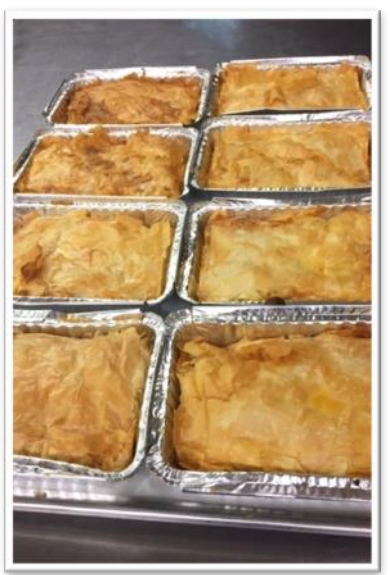
Makaropita before and after.