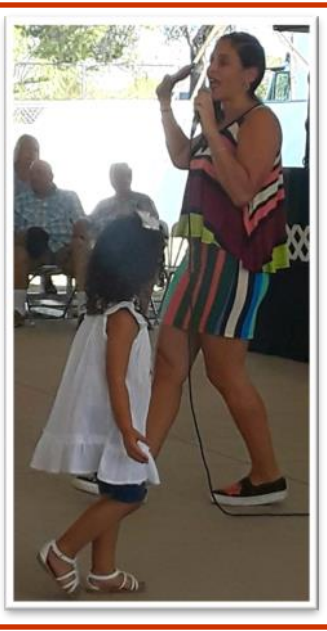
She taught them to say, "Yiasas, thelo ena gyro, para kalo."? ("Hello, I want one gyro, please.")