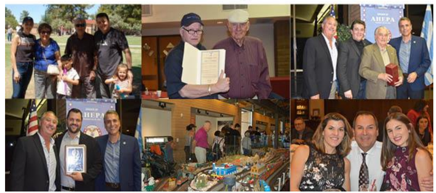
Desert Springs June/July 2018