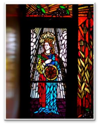
St. Katherine faceted glass icon in the south wing of the Narthex.