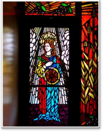
St. Katherine faceted glass icon in the south wing of the Narthex.

Next Meeting on Thursday, September 5, 2024 at 6:00 pm First in the Cathedral for the Blessing of the Waters, then in the Lounge of the Speros Community Center ഗ്രെ