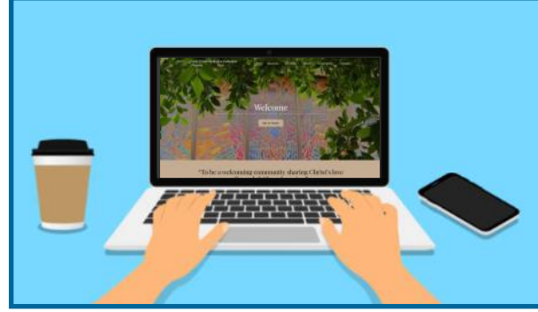
Have you checked out the website lately ? www.holytrinityphx.org Events • Services • Photos • Calendar • Stewardship