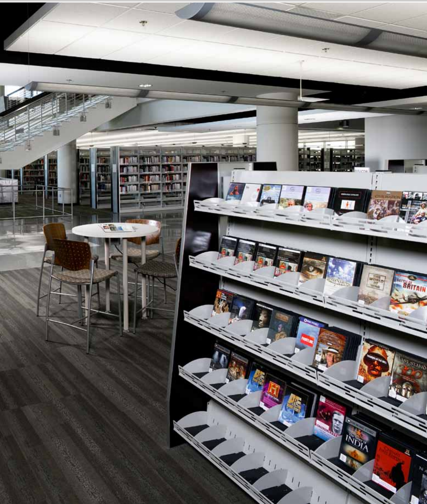
Georgia Gwinnett College, Lawrenceville, GA