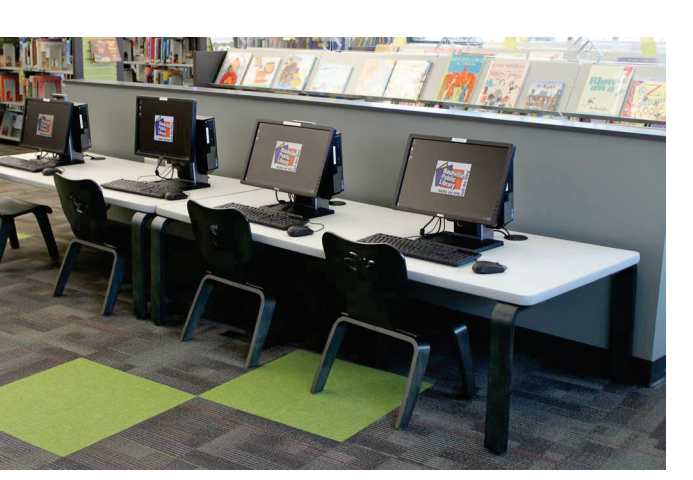
Plover Tables are used as places for a bank of computer stations. Perimeter characters at right are a friendly addition and children are smitten