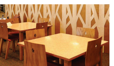
ctured above: Kestrel Chair with oak shells. Ode Creative Wall Panels.