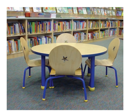
Lorca Chairs above and Lorca Perimeters pictured below.