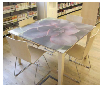
lick Square chairs with Kestrel Table

The Flick Chair is modern and versatile that fits easily in any library interior. Here shows how to lines the Flick and Kestrel can merge effortlessly into an attractive solution.