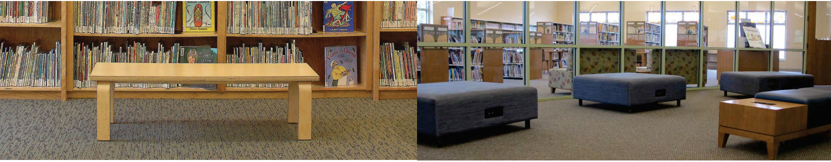
Pictured: Ployer Child Bench with wood sea

TMC's Benches for adults and kids are attractive and versatile, pairing up to many of our chair and table lines. Wood and upholstered seats are standard. Sizes include 48^\circ wide and 60^\circ wide.