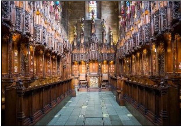
St. Giles in Edinburgh