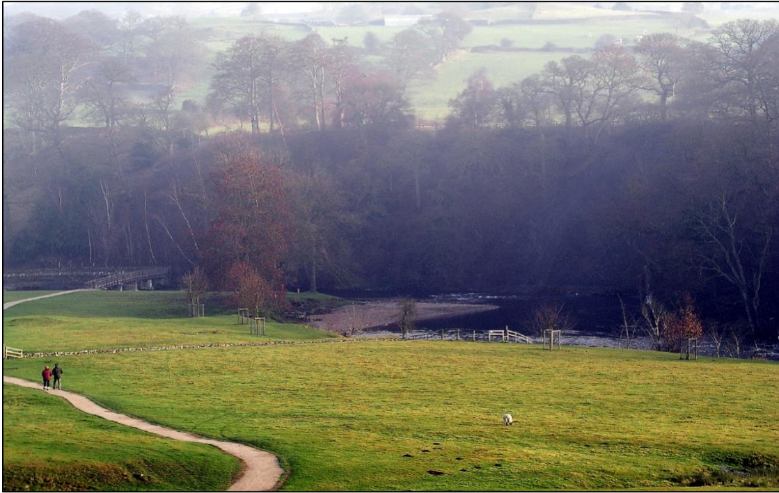
A morning walk in the North Yorkshire Dales, England