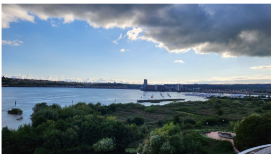
Cardiff Bay, Wales

We also accept payment via Zelle at maryvalentinetours@gmail.com .