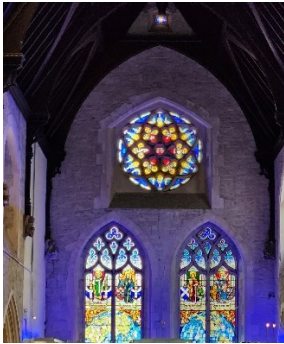
Garden Museum, London

May 21: In the morning, we sail from London's Westminster Bridge to Greenwich where we tour the Old Naval College and view its spectacular Painted Ceiling. Then we stop at the Prime Meridian. In the afternoon, we visit the Garden Museum and take a walking tour of Chelsea in Bloom where shops compete for the most beautiful floral decorations.