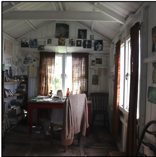
Poet Dylan Thomas' writing studio, Laugharne

In May 2024, we took our first trip to Southern Wales. While there we visited the home of Dylan Thomas, experienced a glimpse into the life of a coal miner, met a skilled wood carver who demonstrated the art of making Welsh lovespoons, enjoyed a night out at the theatre, toured the Welsh Parliament, and sat in on a rehearsal of one of Wales's more than 200 male choirs. Here are some photos from that trip: