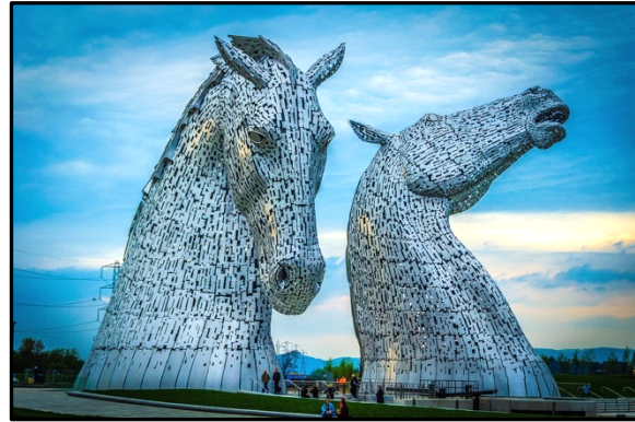
Kelpies Equestrian Statue