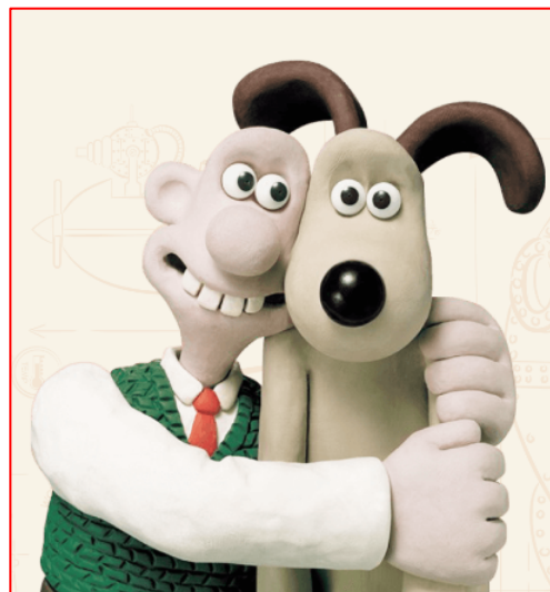
Wallace and Gromit

While the museum may be intended for the young, it is entertaining for those of us who are young at heart. So, join us in 2026 when we will visit this museum along with many other creative spaces and see, among other treats, how Wallace and Gromit films are made. It should be a cracking time for all of us.