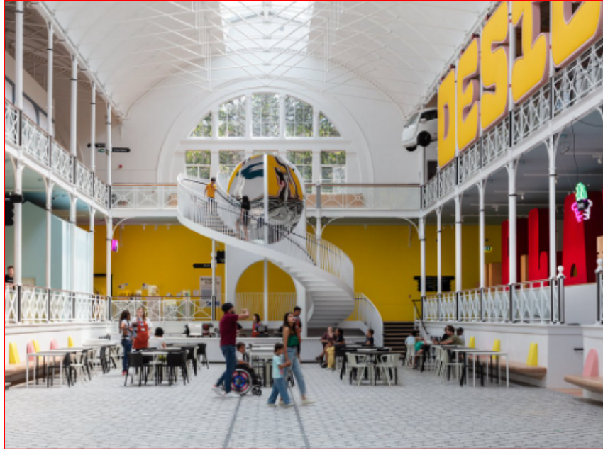
Young Victoria and Albert Museum