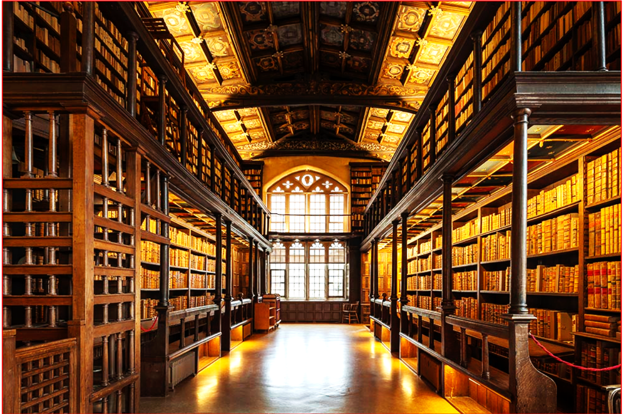
Bodleian Library in Oxford