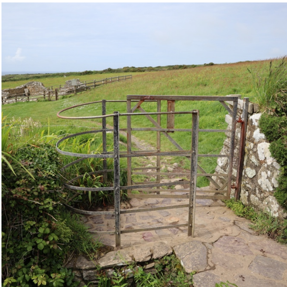
"Kissing Gate" in Wales