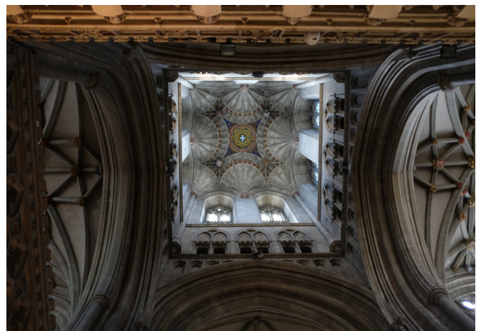
Cathedral in Canterbury