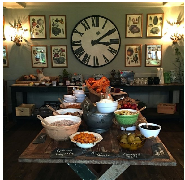
A wonderful breakfast spread