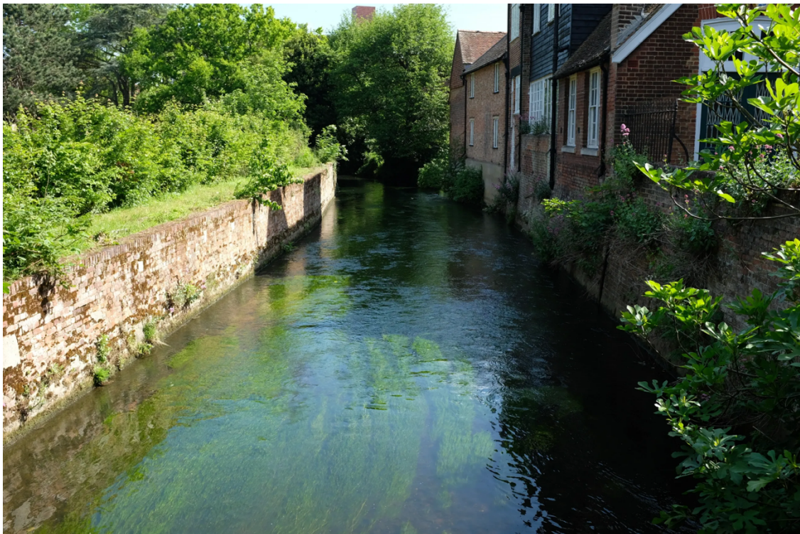
Punting in Canterbury