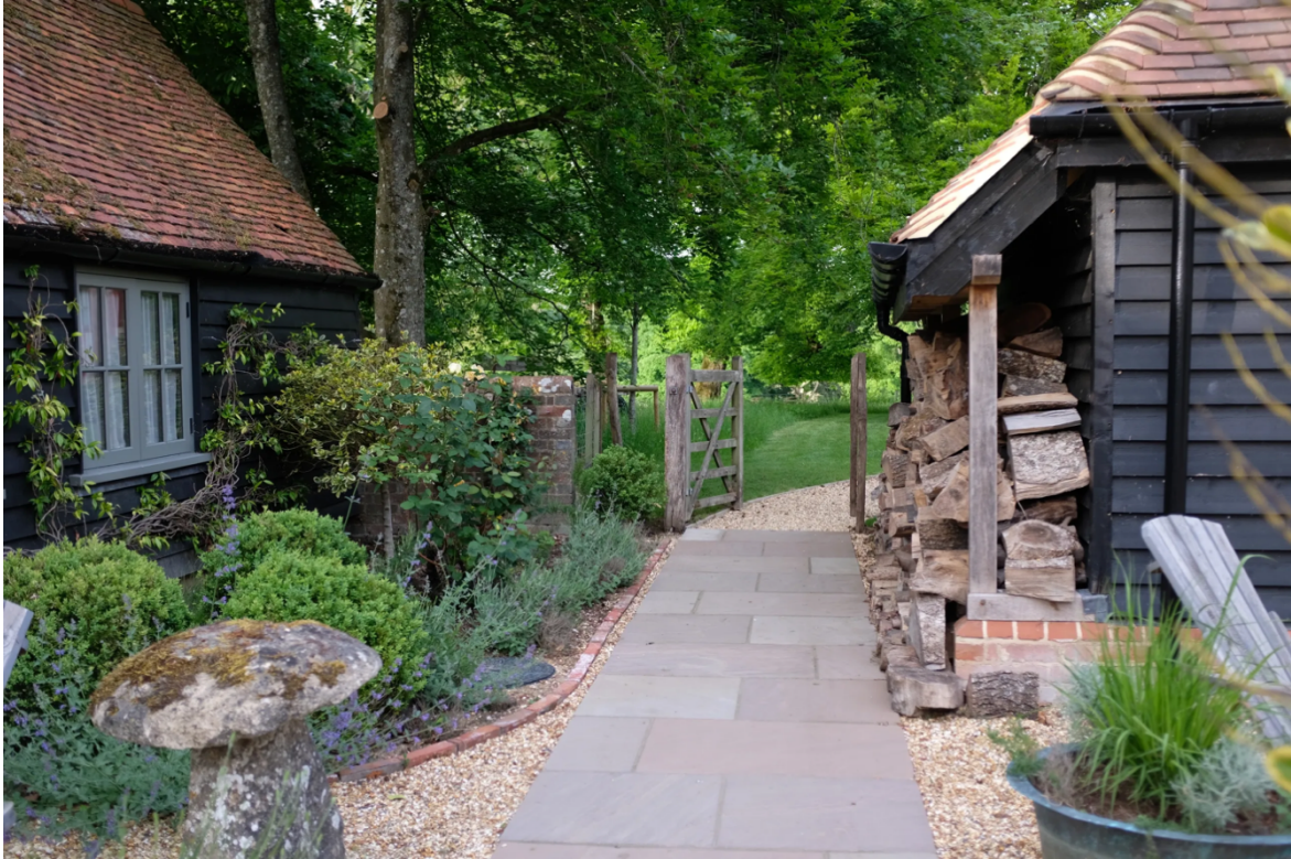
The Pig Hotel Near Bath