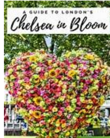
Chelsea in Bloom

May 22: Our schedule includes a visit to the Staterooms at Kensington Palace, as well as a special exhibit at the recently reopened National Portrait Gallery. An early dinner at the Portrait Restaurant will be followed by a candlelight concert at St.-Martin-in-the-Fields.