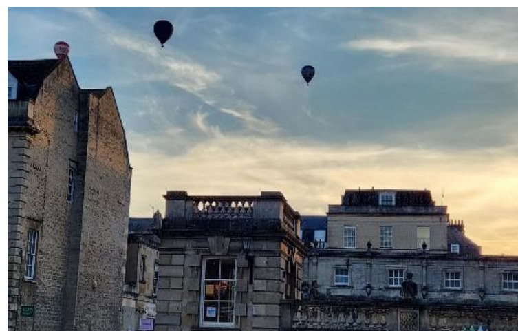
Hot air balloons over Bath