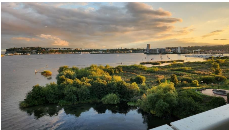
Cardiff Bay, Wales