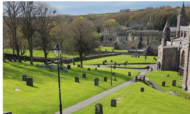
St Davids, Wales