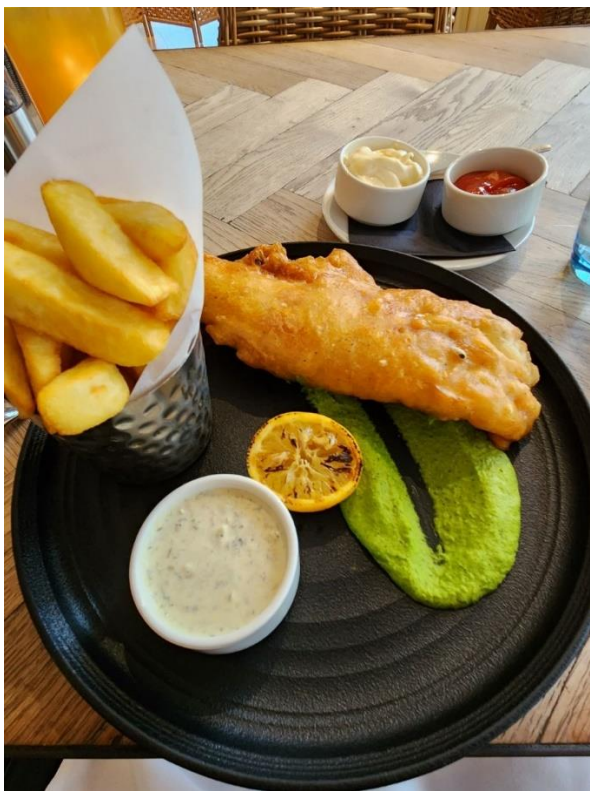
Best fish and chips ever