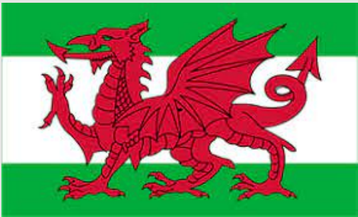
Cadwaladr, the red dragon of Wales