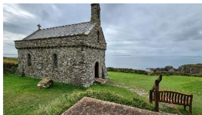
St. Nons Chapel, Wales