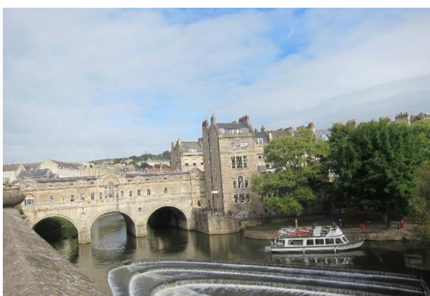
The Weir, Bath

Here's a sample of what you'll experience on our tour.