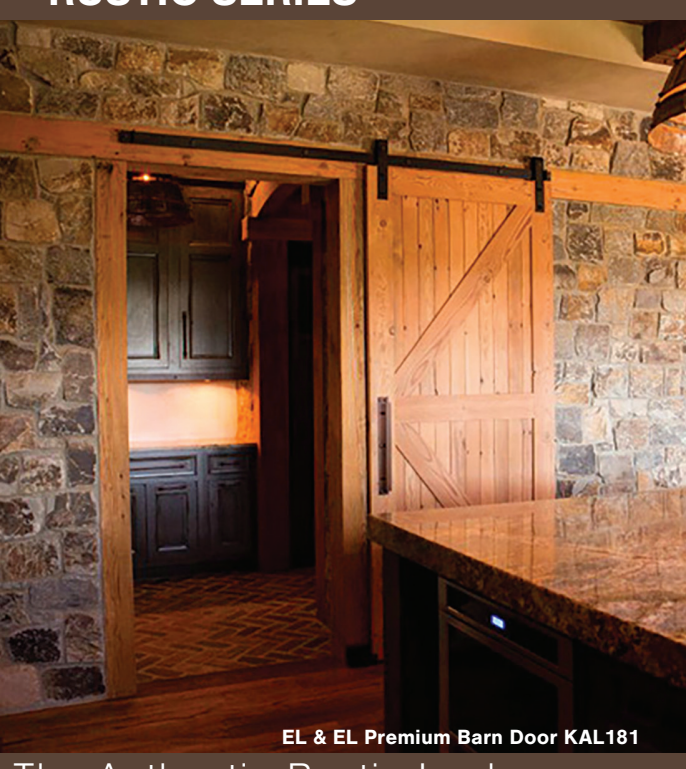
The Authentic Rustic Look