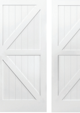
PRM 180PLK PRM 181PLK PRM 183PLK