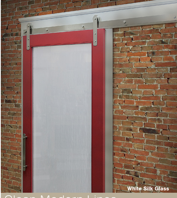
Clean Modern Lines