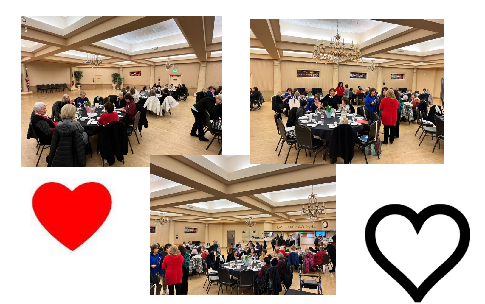
2023 JANUARY NEW MEMBERS!

CHECK OUT these and other PHOTOS on our WEBSITE IAWGSM.ORG under PHOTO GALLERY