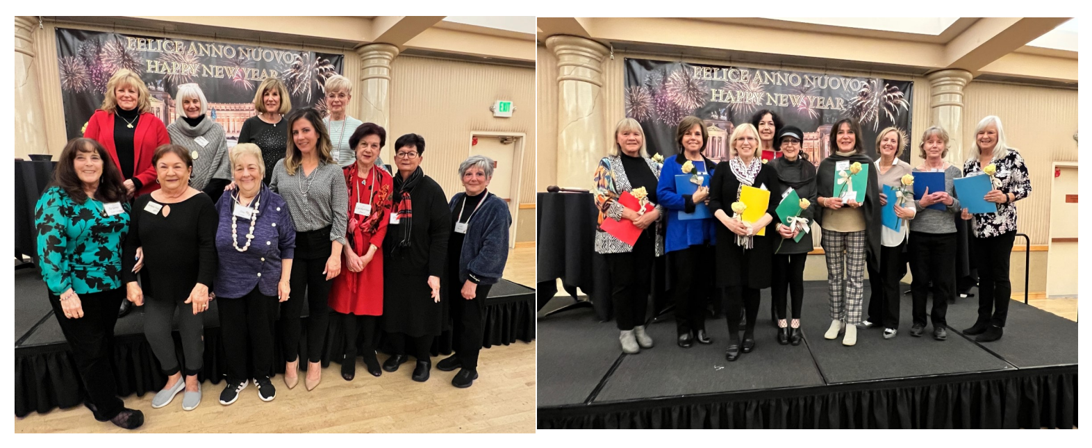
2023 OFFICERS AND BOARD OF DIRECTORS