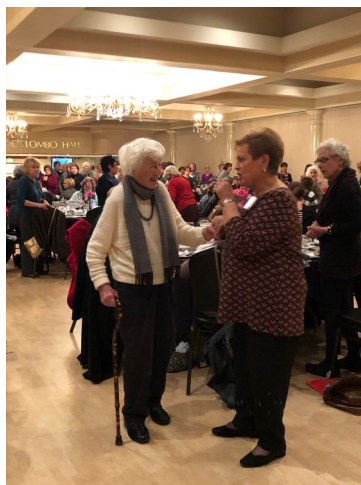
Check out on https://iawgsm.org