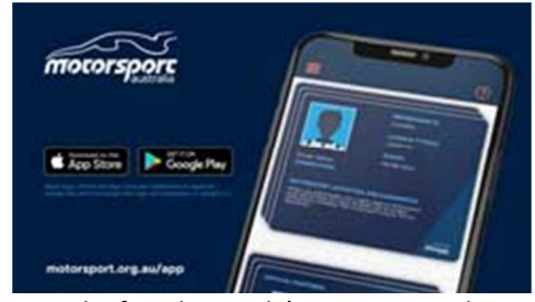
The app can be found in Apple's App Store and Google Play by searching 'Motorsport Australia'.

"Of course, anyone who still requires a physical card can be provided one on request, but as technology changes and people are more likely to move around without a wallet full of cards, we know our members will make the most of this app on their phone or tablet when attending events and needing to show their licence."