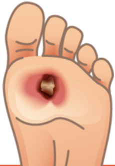
Diabetic Foot Ulcers