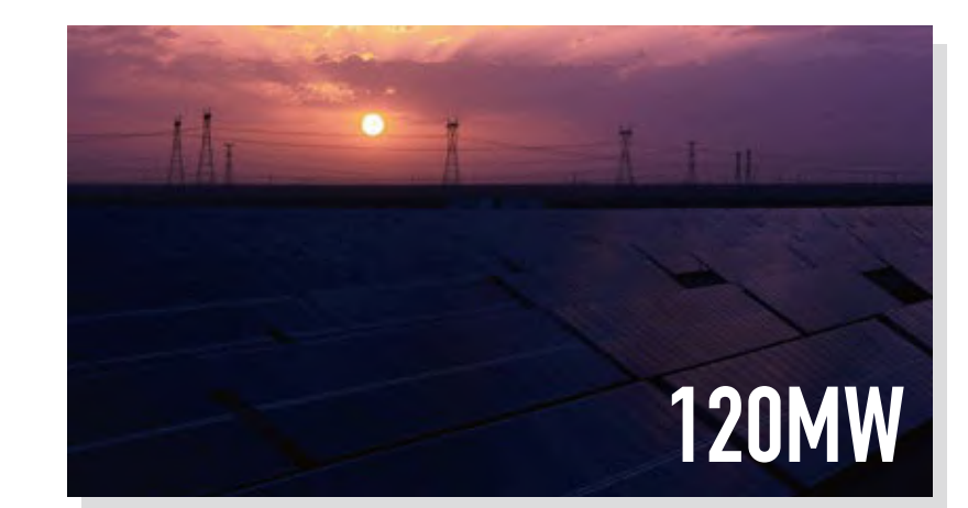
Project Type: G-Mounted Location: China / Qinghai Commission Date: 2016-12 Product: SRP-250-6PB