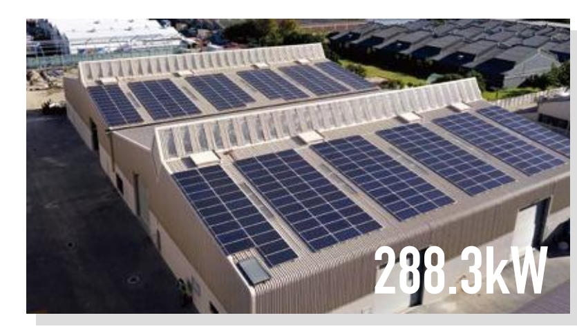
Project Type: Commercial Rooftop Location: South Africa / Cape Town

Commission Date: 2018-3 Product: SRP-320-6PA