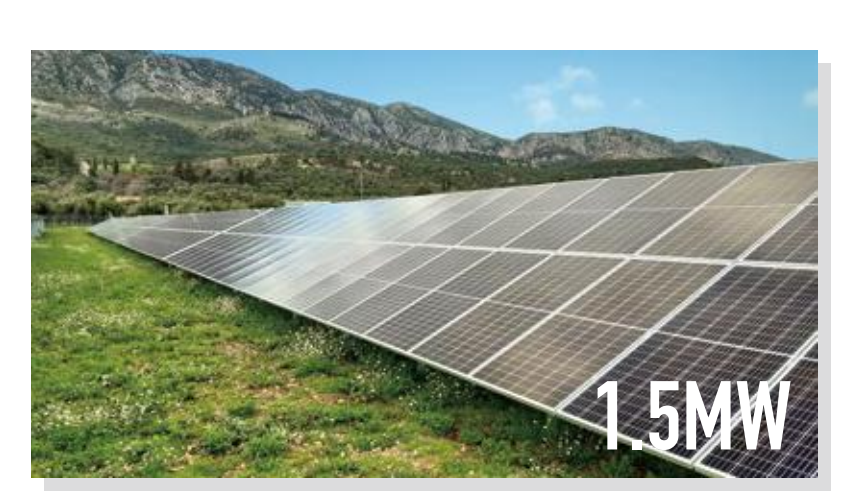
Project Type: G-Mounted Location: Greece / Astakos Commission Date: 2020-5 Product: SRP-395-BMA