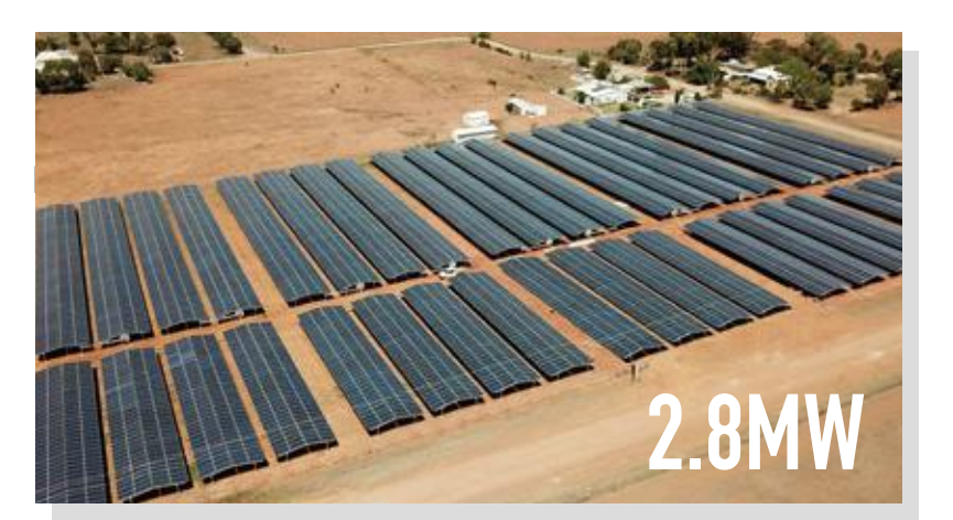
Project Type: G-Mounted Location: Australia / Yongala Commission Date: 2019-1 Product: SRP-330-6PA