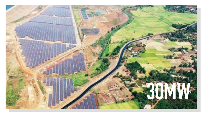
Project Type: G-Mounted Location: Vietnam / Dak Lak Commission Date: 2019-5 Product: SRP-345-6MA