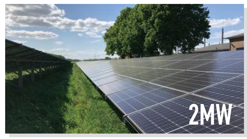
Project Type: G-Mounted Location: Netherlands / Goor Commission Date: 2020-6 Product: SRP-320-BMB