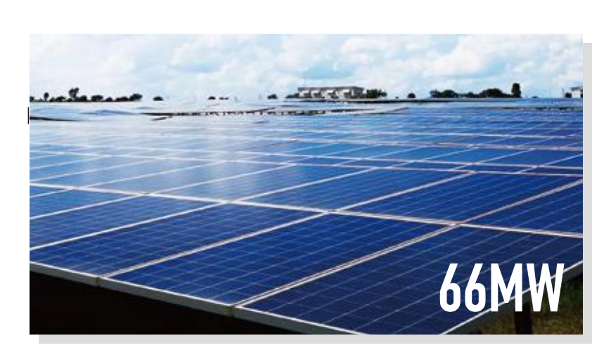
Project Type: G-Mounted Location: India / Karnataka Commission Date: 2017-6 Product: SRP-6PA-Series