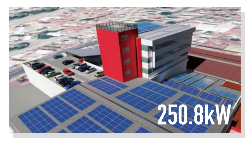
Project Type: Commercial Rooftop

Location: Guatemala / Ciudad de Guatemala