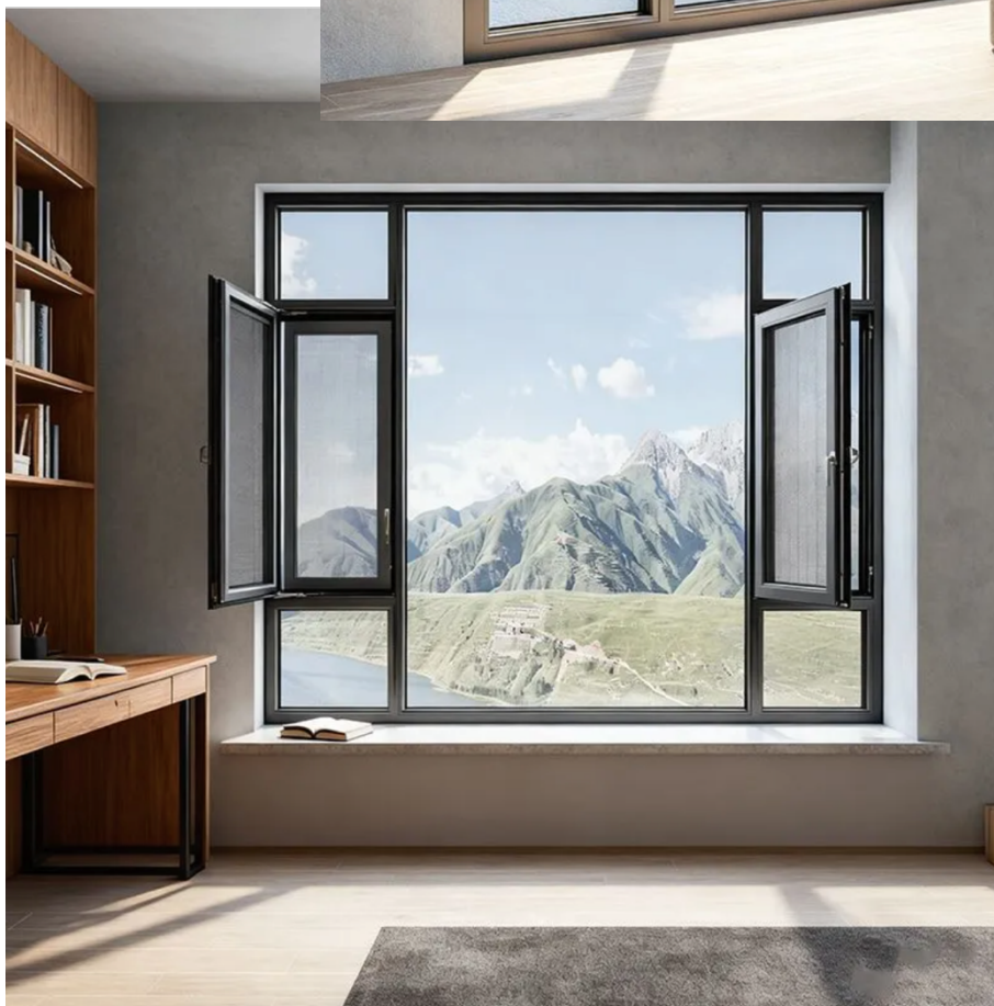
68 Series Aluminium Casement Window Thermal Break with Integrated Screen