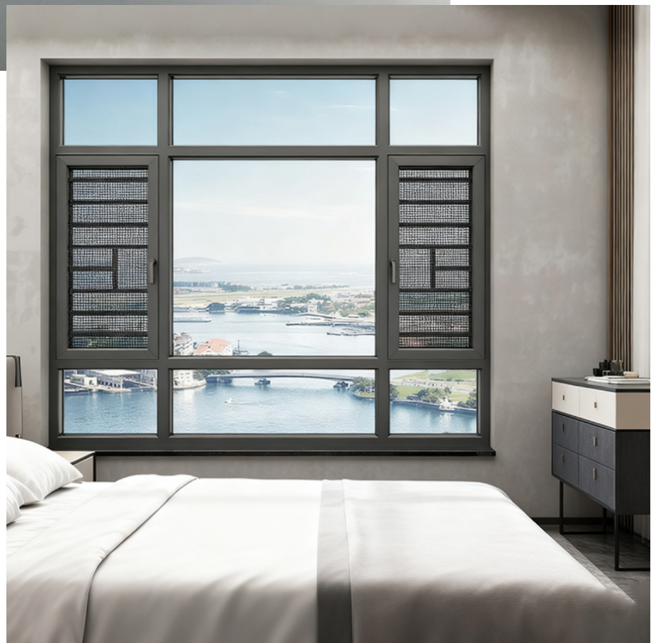
128 Series Aluminium Casement Window Double Thermal Break with Integrated Screen