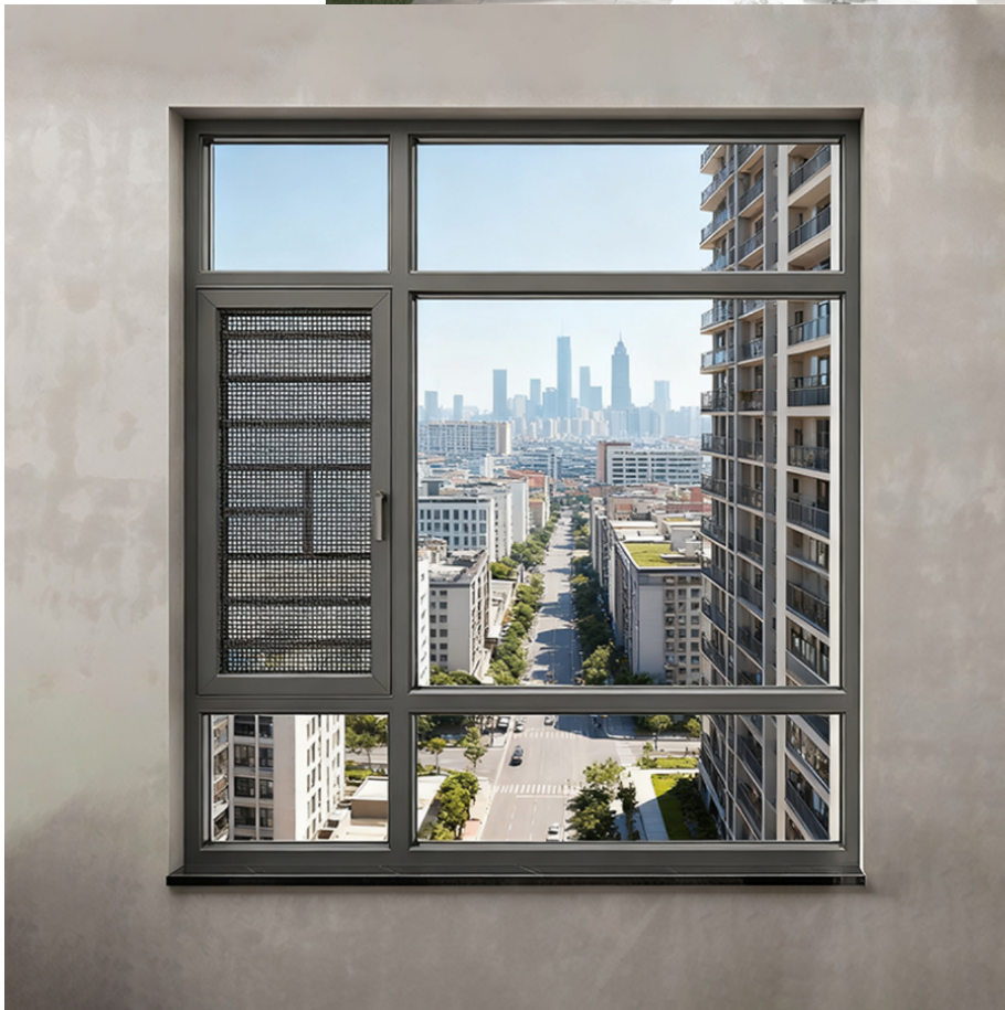
128 Series Aluminium Casement Window Double Thermal Break with Integrated Screen