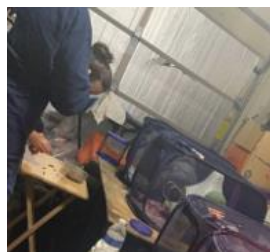
Feeding mealworms to Purple Martins before transport to Wings of Hope