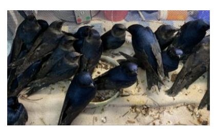
Purple Martins in "ICU" recuperating