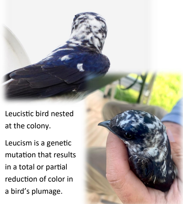
Leucistic bird nested at the colony.

Leucism is a genetic mutation that results in a total or partial reduction of color in a bird's plumage.