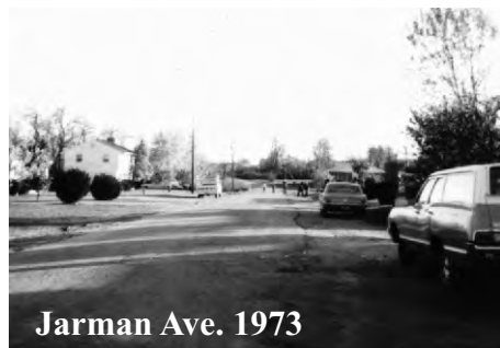
Jarman Ave. 1973