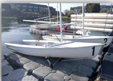
Ideas for sailboat and kayak storage and better usage at our docks.