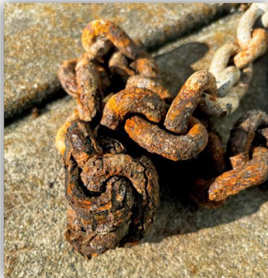
One of Many Fine Examples

I tried beating on it with a winch handle, but the rusted ball refused to untangle. Just as well, since the links were so badly damaged, they probably would not have made it through the night. I, however, was up most the night worried I would drag anchor and end up in the rocks by Tiburon or worse, but the anchor held, the winds died down and I finally got some sleep. I did get the bottom done; Spaulding did an excellent job.