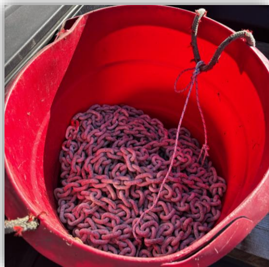
Bucket of Almost Good Chain

After carrying all that chain around for many years, I had the genius idea to remove about 150 ft. to take a little weight out of the bow. Blue Eyes would sail better, and I would have all that chain as a spare, or sell it off at the Blue Pelican, or so I thought.