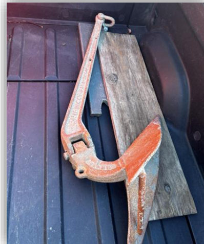
The slightly rusted anchor

When we went to pull it up, that's when the winch motor literally blew up, I have always blamed it on Mike since he was the last one to touch it, but in reality, it was just an old motor which had reached the end of its life. Mike and crew valiantly pulled up the 200 ft. of chain without too much complaining at 2 o'clock in the morning as we made our way north in the dark although calm weather, waiting for the sun to rise.