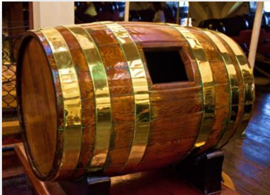
Photo depicts the scuttlebutt on the USS Constitution

“Skyscraper” now means a very tall building, but the term was first used for the top-most sail on a square-rigged ship; it was triangular and set above the square skysail or the square moonraker. Sometimes, the wind aloft was stronger than closer to sea level, hence the need for sails positioned high up.