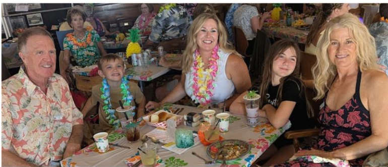
Three Generations of Tosts