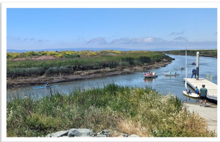
Opening Day Regatta

Our next outing is planned for sailing at Redwood City and our new sailors can test their skills there.