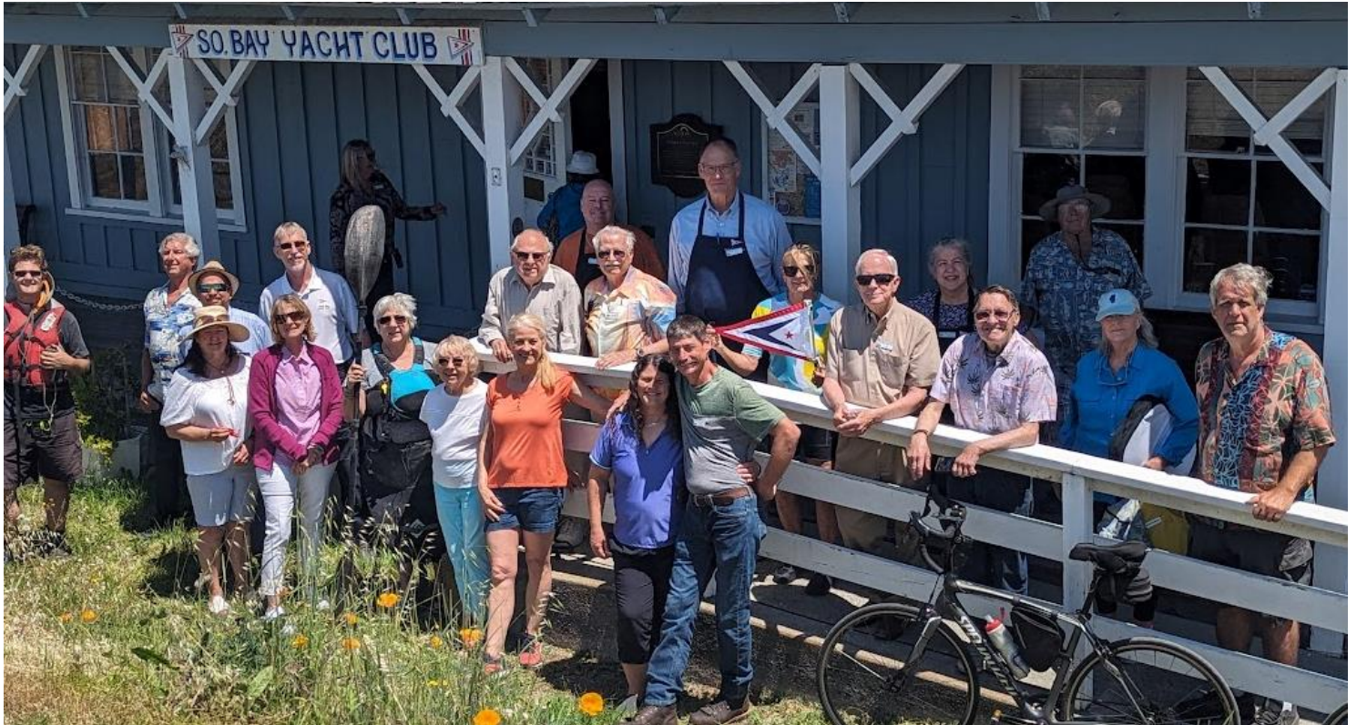
Opening Day on the South Bay 2024 Annual Photo