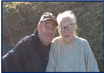
New Friends and Old