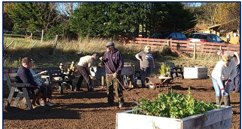
Volunteers working hard on your Community Garden