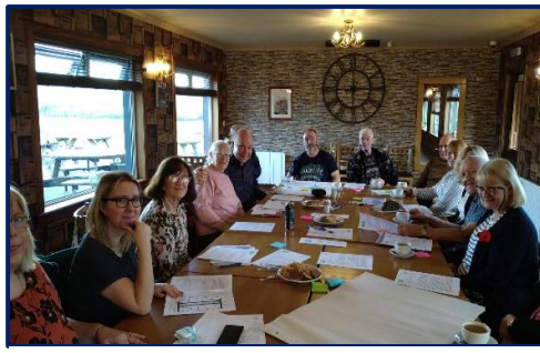
Joining in and having a Say