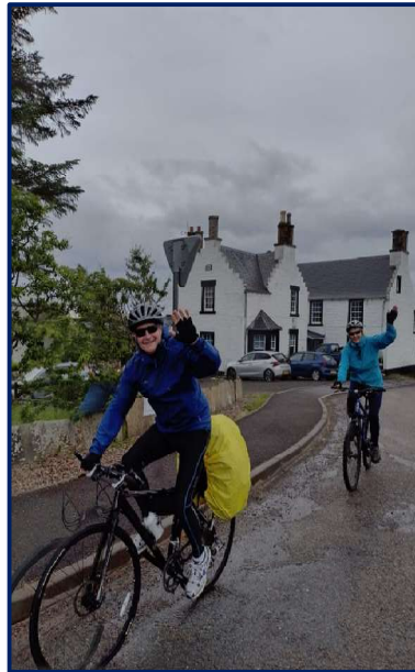
Sponsored Bike Ride