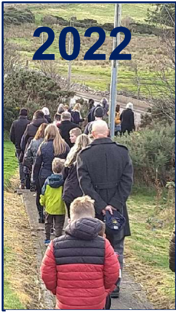
Lest we not forget