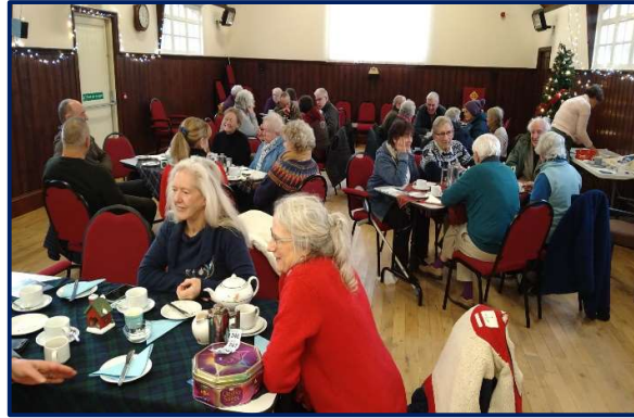
Coffee Mornings at Halladale Hall are back!