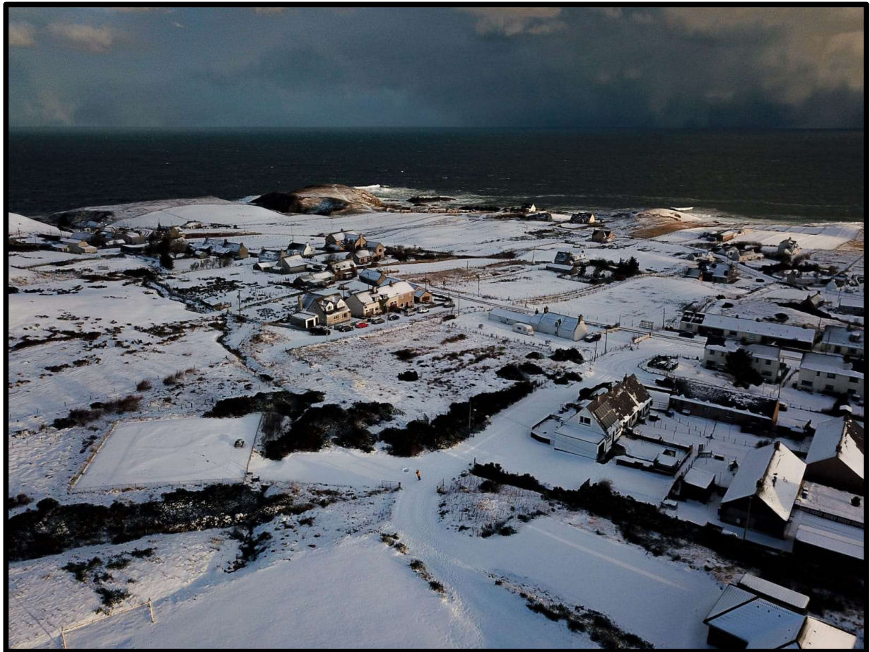
Portskerra in the snow.