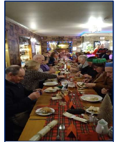
Coming Together for Christmas or a nice hot coffee at Coastline Cafe