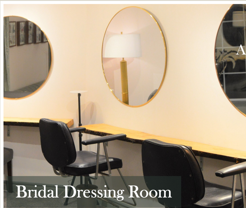
Bridal Dressing Room