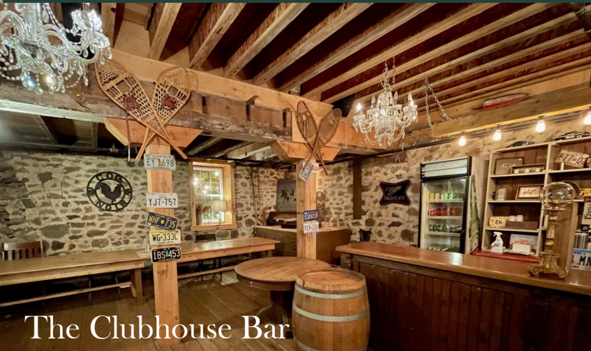
The Clubhouse Bar