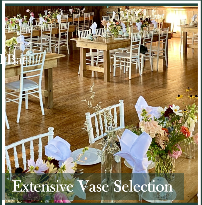
Extensive Vase Selection