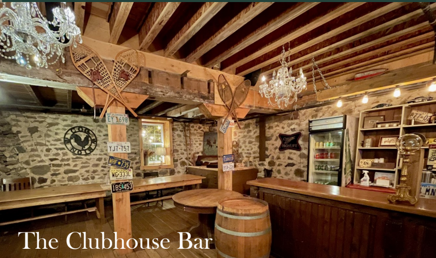
The Clubhouse Bar