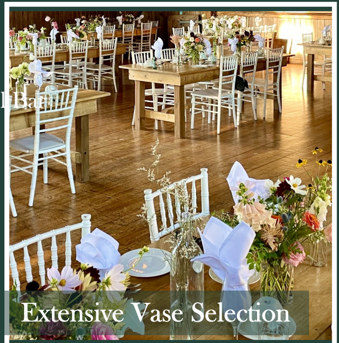
Extensive Vase Selection