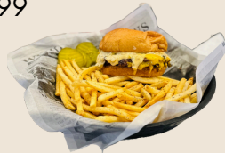
(pictured with shoestring fries)

Burger patty, mushrooms, swiss cheese, lettuce, tomato, and red onion