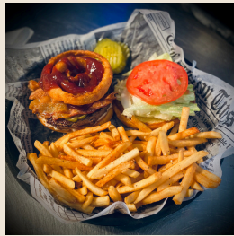
(pictured with shoestring fries)

Consuming raw or under- cooked meats, poultry, seafood, shellfish, or eggs may increase your risk of foodborne illness