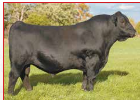
GIBBS 7382E BROAD RANGE • PB SM ASA#3404807 • SIRE TO LOTS 1-4, 67