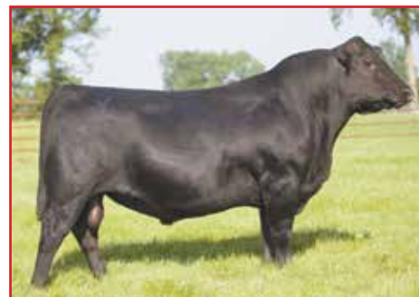
YON SALUDA • PB AN AAA# 20336998 • SIRE TO LOTS 47,48