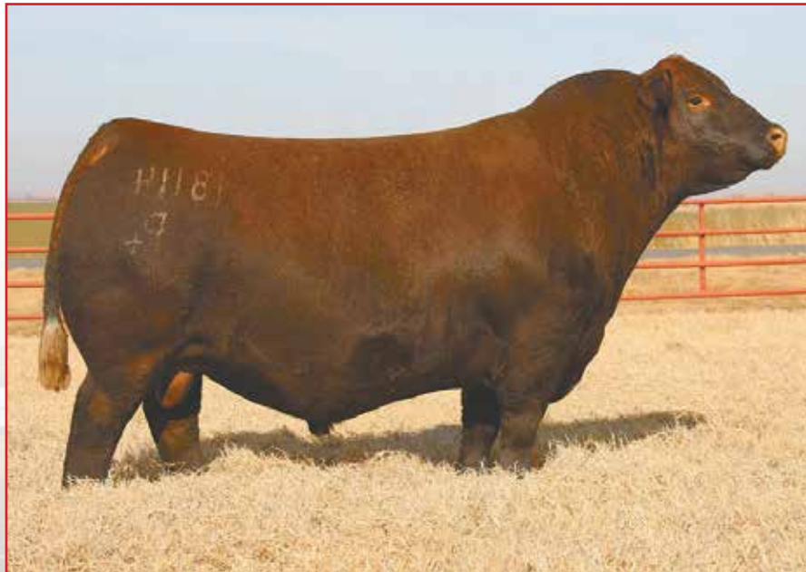
DUFF RED BLOOD 18114 • RED ANGUS • ARAA# 4091208 SIRE TO LOTS 31-33