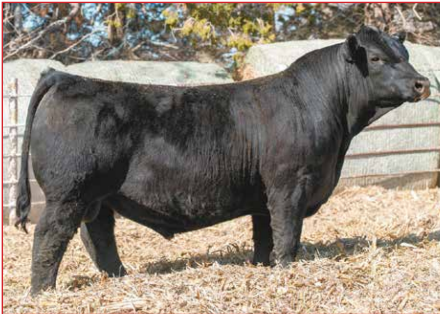
LRS DUTTON 611K • PB SM • ASA# 4046516 SIRE TO LOTS 15-17,62