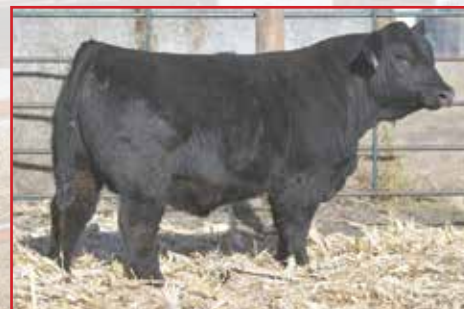
MR NLC CASHFLOW 0062H • PB SM ASA#: 3852801 • SIRE TO LOTS 20-22, 63, 65