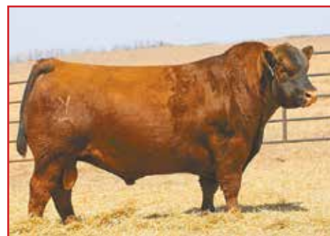
RREDS BLUE PRINT H001 • RED ANGUS ARAA# 4287851 • SIRE TO LOTS 28-30,74