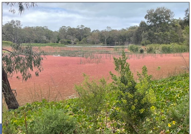
Azolla covering West Lake in early 2024

Our first group of citizen scientists have begun water quality monitoring. These trained community members will be helping us collect key data on nutrient levels, algal presence, and other indicators across both lakes. Their contribution marks an important step forward in our long-term efforts to understand and care for this unique wetland system.