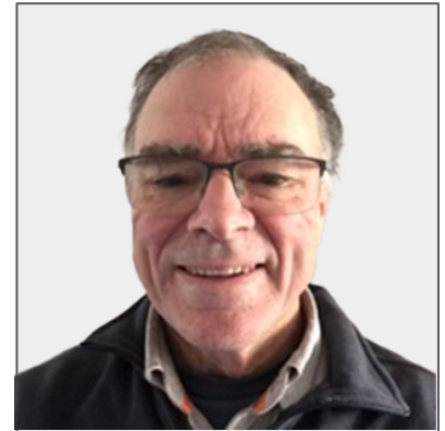
By Dr Don McFarlane

Perry Lakes, like all wetlands, naturally collect nutrients over time. However, when nutrient levels become too high—a condition known as eutrophication—it can lead to harmful algal blooms and reduced oxygen levels in the water, threatening aquatic life and making the habitat less suitable for birds.