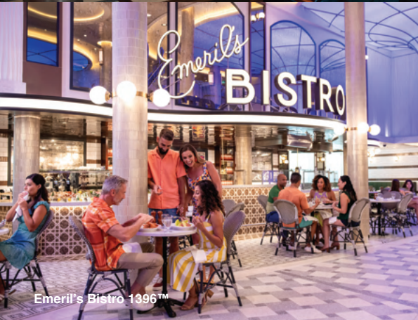
Emeril's Bistro 1396™™