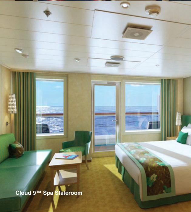
Cloud 9™ Spa Stateroom