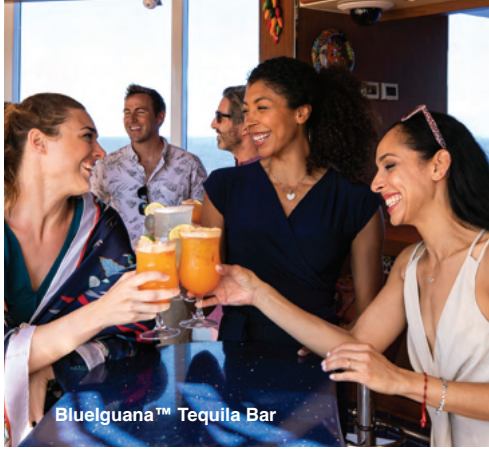
Blueiguana™ Tequila Bar