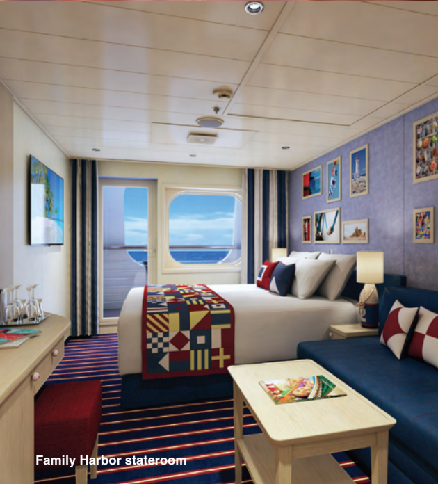
Family Harbor stateroom

Ever dreamt of living like an Italian? Get a taste of the lifestyle in a Terrazza Stateroom aboard any Carnival Fun Italian Style™ ship. Each room features a resort layout with plenty of space to make yourself at home. Select a room with a patio or balcony to enjoy the outdoors, and if that sounds good, check out the grandissimo balconies in a select few staterooms. Guests of Terrazza staterooms gain exclusive access to the Terrazza Carnevale area. (All Terrazza stateroom guests must be 12 or older.)