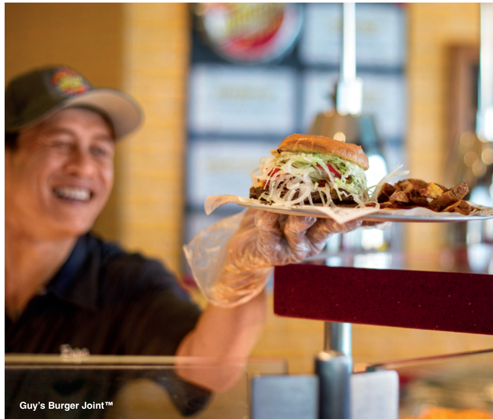
Guy's Burger Joint™

Whether you need a late-night bite or simply prefer not to leave the quiet comfort of your stateroom, we've got all your cravings covered. Order from our room service menu* 24 hours a day via phone or on our Carnival HUB™ app.