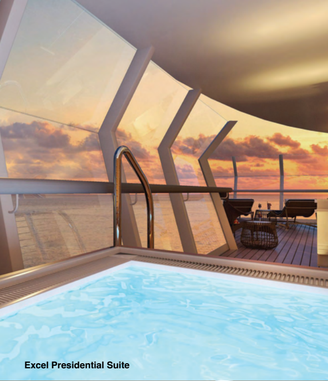
Excel Presidential Suite