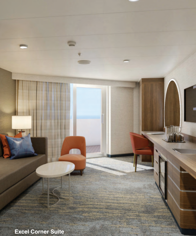
Excel Corner Suite