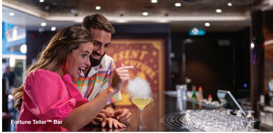
Fortune Teller™ Bar