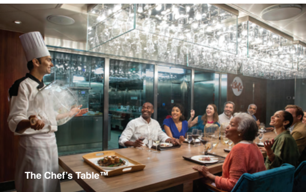
The Chef's Table™™

The latest additions to our dining venues let you savor flavors from all over. At Cucina Del Capitano®¹ enjoy family-style Italian dining. Don't miss Chibang!™™ , an elegant, modern spot serving Chinese and Mexican cuisine. Try Emeril Lagasse's signature creole cuisine at Emeril's Bistro 1396™™* and Emeril's Bistro 1397™™* . If you're sticking with seafood, master chef Rudi Sodamin has you covered at Rudi's Seagrill™™* .