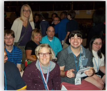
Indiana Stories - La Porte County Symphony Orchestra's Education Concert - October 12 th