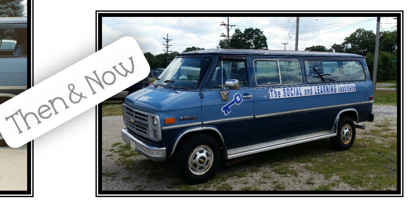
NOW—2016: The 1990 van is still going but in need of regular and expensive maintenance.