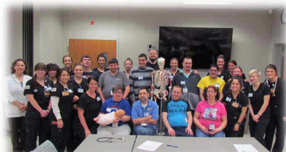
Visit to Purdue University Northwest College of Nursing

We are inviting our business community to partner with us to further the mission of our program.