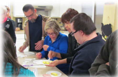
Nutrition Education & Cooking Class