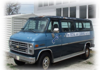
Big Blue Retiring - 1990 Chevrolet Thanks for 28 years of fun adventures!

The Institute is beyond grateful to the many individuals and organizations whose faithful support, effort and determination led to this exciting time of celebration.