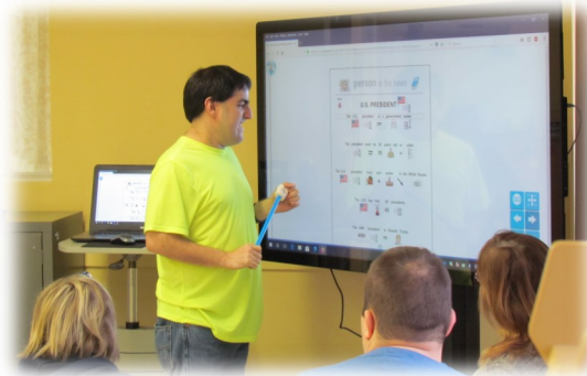
Learning with Interactive Touchscreen Technology