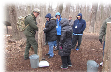
Maple Sugar Time at IN Dunes National Lakeshore