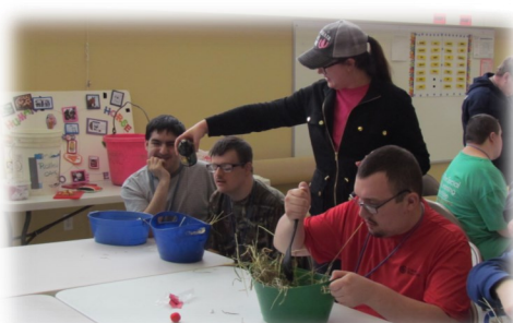
Making salads for the horses