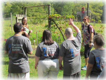
Dunes Learning Center Chellberg Farm & Bailly Homestead