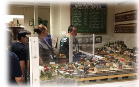
La Porte County Historical Museum