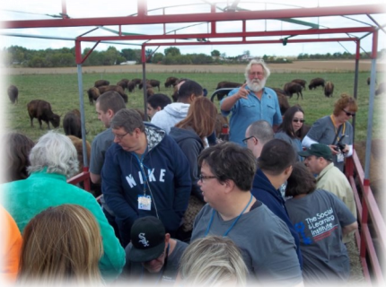
Broken Wagon Bison Ranch