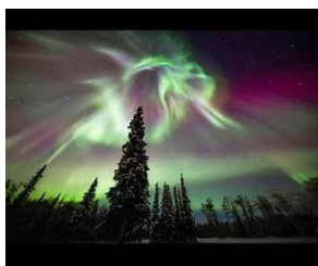
Northern Lights - Finland

There is still space on the Culinary Journey Through New England this fall, and Finland Northern Lights tour in January