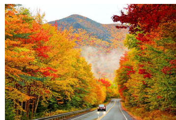
New England Culinary Journey

Four Gals have registered for the Christmas Market cruise in December of 2026. Some cabins are still available. It may be in 2026! but this trip sells out FAST!.