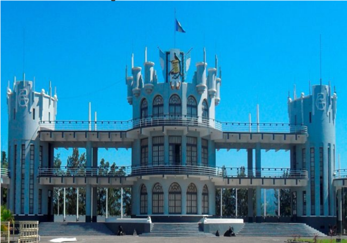
Tribuna Militar del Campo Marte

The street, 32 Calle, ties together two significant monuments: Tribuna Militar del Campo Marte and the Monumento de la Estrella. This design will keep the current sightline open to respect the urban context and retain the visual tension bwteen the two points. The south half of the site is dedicated to the new stadium while the north half is planned for furture hospitality and entertainment compound.