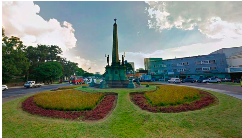
Monumento de la Estrella