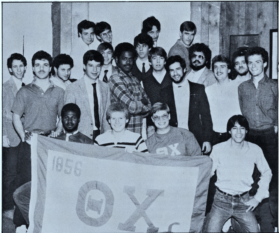
Gathering for a group photograph, the actives proudly display the Fraternity letters