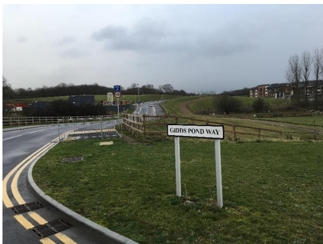
The KIMS site

states “vehicular and pedestrian access via Kent Medical Campus, together with associated car parking and drop off area, pedestrian access”.