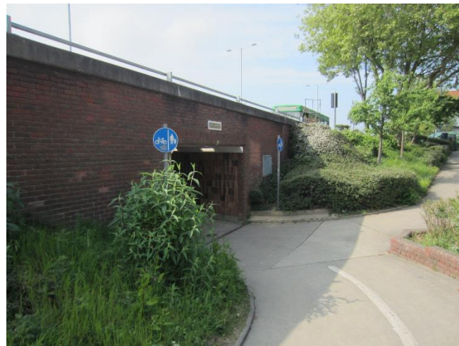
The Medway Street underpass

We are currently trying to persuade Maidstone Borough Council to resolve the flooding and safety issues with the Medway Street underpass which they have acknowledged they have funding for.