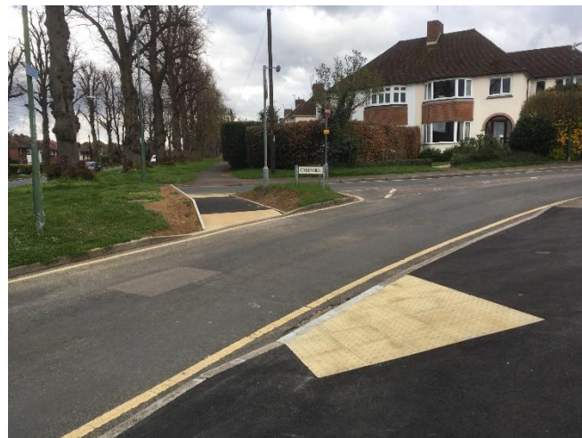
Dropped Kerb Provision at Greenside

project has begun to improve pedestrian and cycle access.