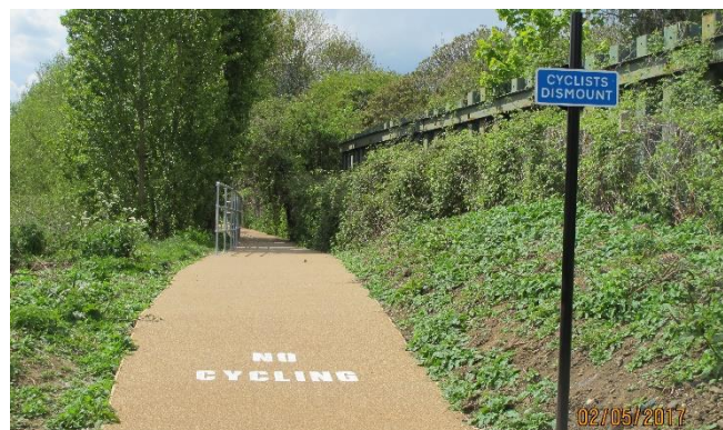
The River Medway Towpath

The River Medway Towpath runs between Aylesford and Barming (total length: 10.5km). Unfortunately, some sections of the River Medway Towpath need improvements and MCCF have alerted the local authorities about our concerns with some sections.