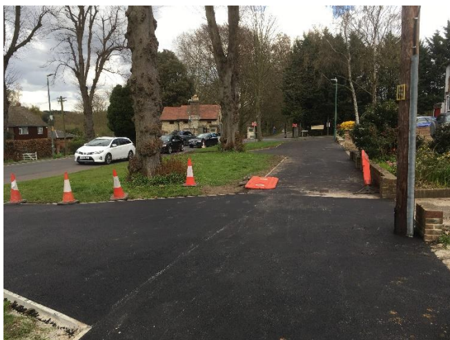
Mote Road looking towards Mote Park

Work commenced in February and is nearing completion.