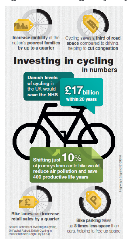
Figure 2: Investing in cycling<sup>5</sup>

2.10 The case for investing in walking and cycling is well established, and some of the benefits are set out in Figure 2.