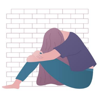
The Story of an Adolescence, Interrupted <u>Read More</u>