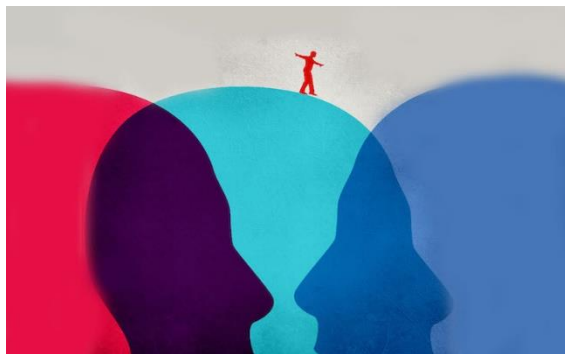
DID Stories Are Riddled with Stigma: I Want to Tell a More Accurate One Read More