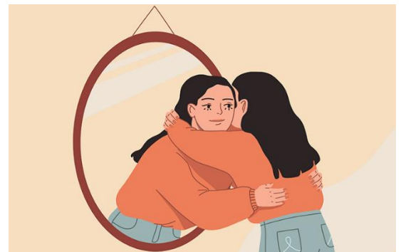
Fighting Internalized Stigma and Changing My Attitude Read More