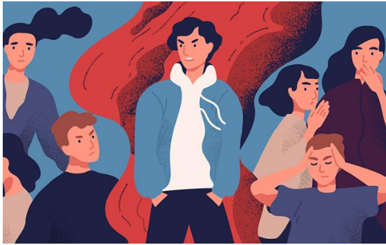
Unpacking Narcissism and Stigma Read More